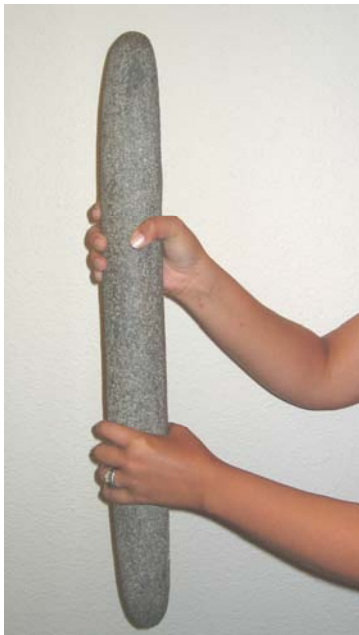
Figure 1. Pestle from Big Springs in Great Sand Dunes National Park and Preserve, largest known specimen, 65 cm in length.

The three specimens examined to date are all coarse orthoquartzite. They measure 30 to 65 cm in length, are round to oval in cross-section, and up to 7 cm in diameter. Pecking is visible in some areas. The surfaces are rounded and smoothed, and bear polish in some areas. However, they lack the convex/convex wear-facets that would suggest use analogous to a mano. Striations are also missing. The ends taper to a slightly rounded point, and some are slightly battered. It is likely that the pointed ends were used. Due to the difficulty inherent in producing such a long, thin groundstone tool, it is hypothesized that the initial form of each pestle was a long, thin clast fractured from bedrock by closely-spaced joints that intersect at nearly 90°.