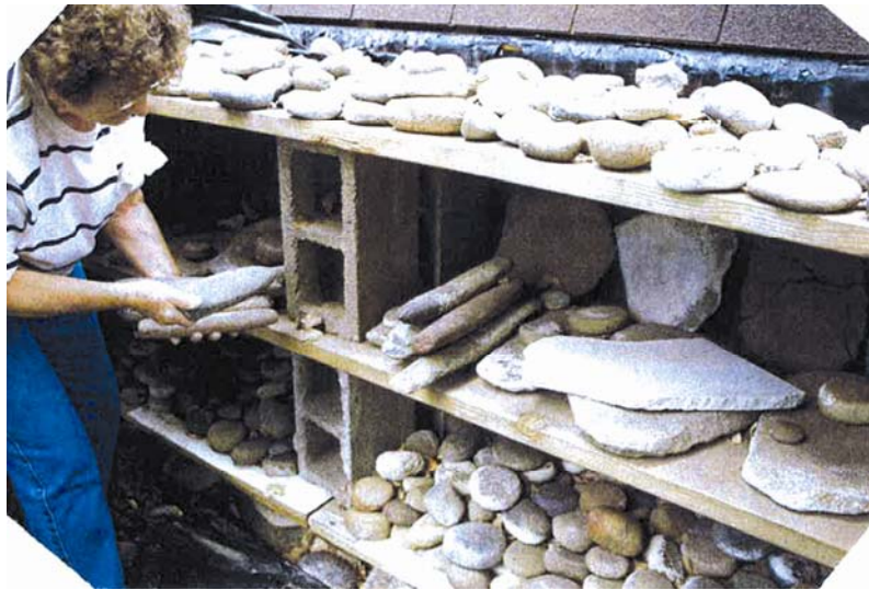
Figure 3. Private collection of pestles (center-left) and other ground stone.

It is possible that these tools were used in processing plant or faunal materials. To address this issue, Paleo Research Institute is conducting tests to determine the presence of different forms of organic matter. To date FTIR (Fourier Transform Infrared Spectroscopy) has indicated the presence of fats, lipids, esters, proteins, cellulose, and carbohydrates that might derive from several different plant and/or animal sources. Further analyses will help to specify the taxa.