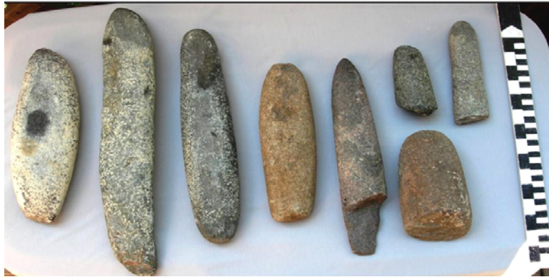
Figure 2. Pestles collected from Sand Dunes by Ray Lyons. Note diversity of sizes.