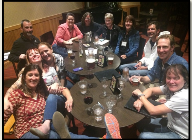
Flashback to 2017 when CCPA members catch up at the Welcome Reception in Grand Junction.

We look forward to welcoming you to Longmont and the Annual Meeting at the annual Early Bird reception. Registrants will receive two complimentary drink tickets and a cash bar will also be available. Light appetizers will also be served. The Reception kicks off at 6 PM, so arrive early and grab some dinner with friends at one of the nearby restaurants, then head over to the Plaza Convention Center. The Reception will end at 9 PM (but some nearby restaurants are open later for those night owls that want to take the party elsewhere).