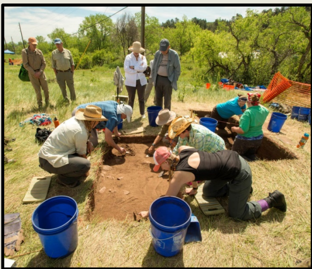
Volunteers excavate at the Magic Mountain site in 2017.