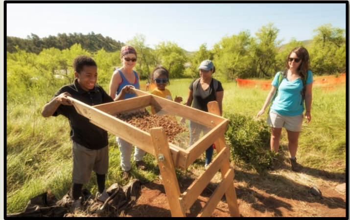
Volunteers screen dirt at the Magic Mountain site.

In June 2017, we returned to the site to excavate these areas of interest through a community-based effort. The magnetometry survey was extremely productive. Based on the results we identified and excavated five rock-filled hearths and a roasting oven that is possibly inside a structure. We found countless fragments of grinding stones, various projectile points, and a handful of gray cord-marked ceramic sherds. Preliminary data suggest that people were primarily using raw stone materials from South Park and the Southern Front Range. The topographic location points to a cooler season occupation and the distribution of hearths and features suggests regular to intermittent use over a long period of time. Activities included food preparation, cooking, and projectile point manufacture. The analysis of the artifacts, botanical remains, and C14 samples begins this month and we will have much more to report soon. We also hope to return to the site in the future to fill in the gaps and address new questions that arise from our analysis.