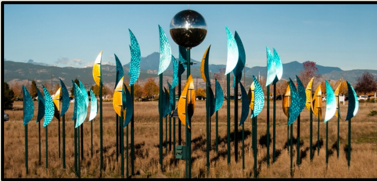
Longmont City entrance, with Longs Peak in the background.

The 2018 CCPA meeting will be held in the city of Longmont, located about 20 minutes from Boulder and an hour from Denver. Longmont was a vision shared by railroad investors from Chicago, Illinois in 1870. These investors sold memberships in the Chicago-Colorado Colony to adventurous pioneering families who “were temperate people of good moral character” and were headed west to find a new utopian society based largely on agriculture. In 1871, these pioneers renamed their small community Longmont in honor of Longs Peak, a 14,252 foot peak visible to the west of the city. Longmont has grown from a small agricultural center to a thriving community of about 90,000 residents.