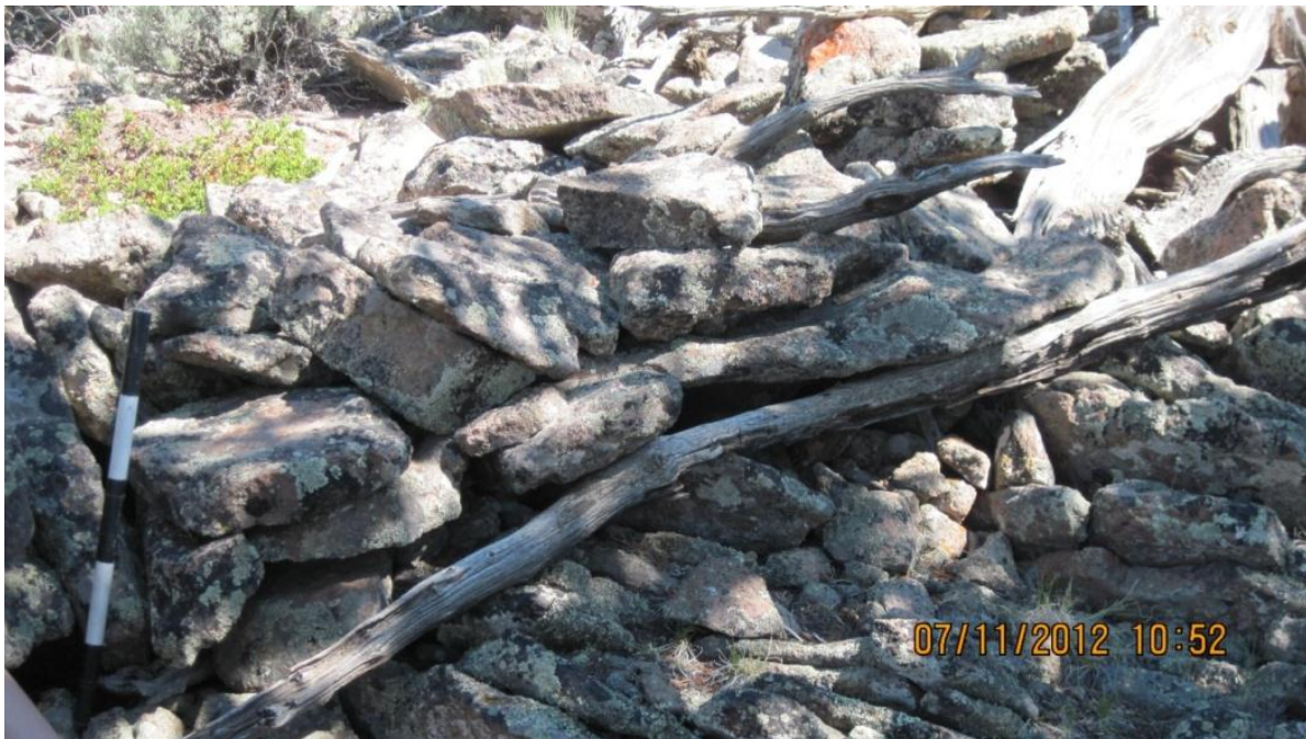
Detail of east face of upper end of wall showing coursed rocks and pine limbs.