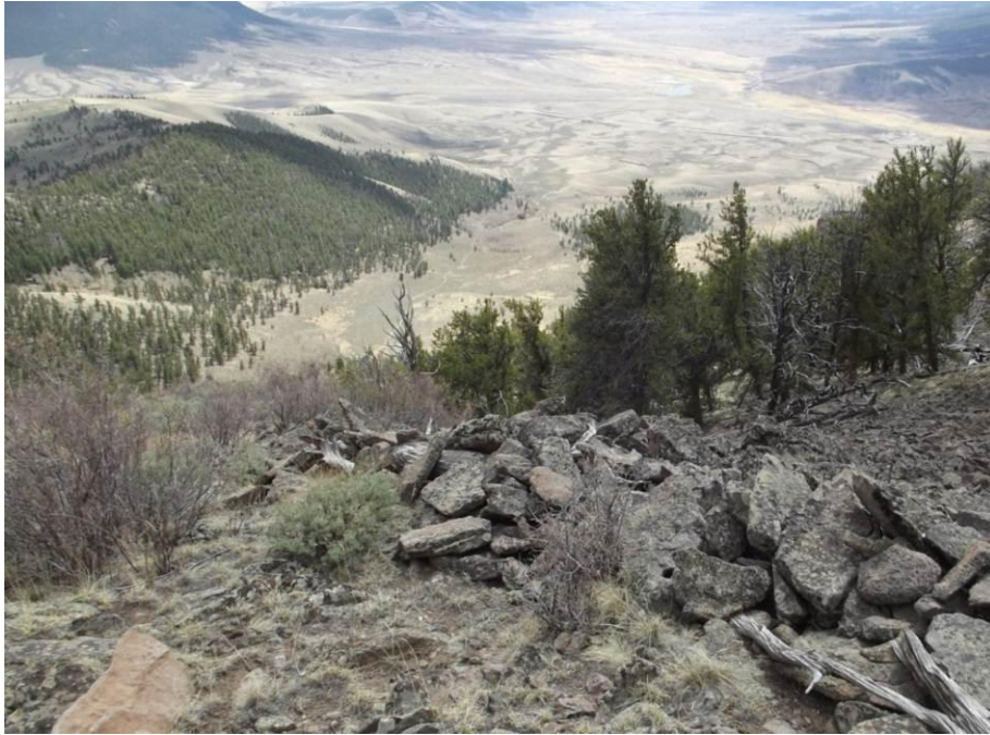
View down the drive wall toward Cochetopa Park in back ground.