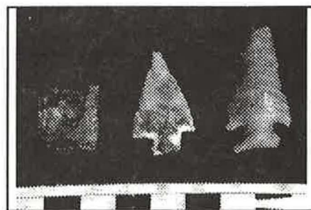
Sample of points from the Tenderfoot site

The Anthropology Department at Western State is currently conducting test excavations