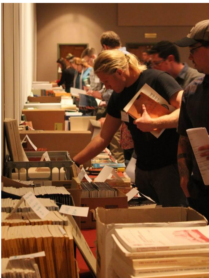
Book browsers and buyers, Estes Park 2015 annual meeting book sale