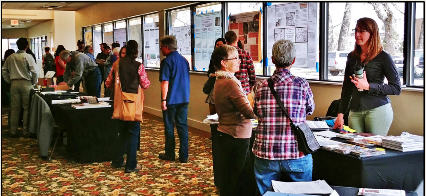
CCPA members visit the posters and exhibits during a break.