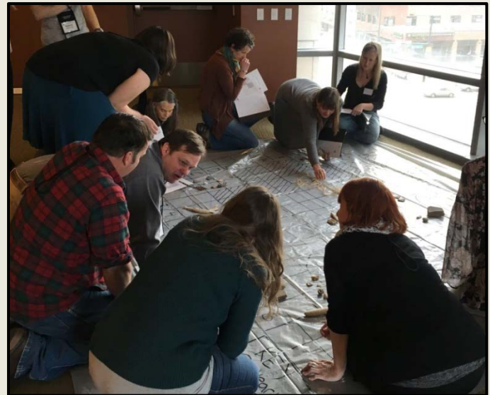
Photos from Colorado Project Archaeology's Facebook album "Denver Project Archaeology Workshop, January 31, 2018."