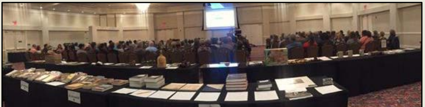
Conference attendees enjoy a presentation with the spread of auction and book sale items in the foreground.