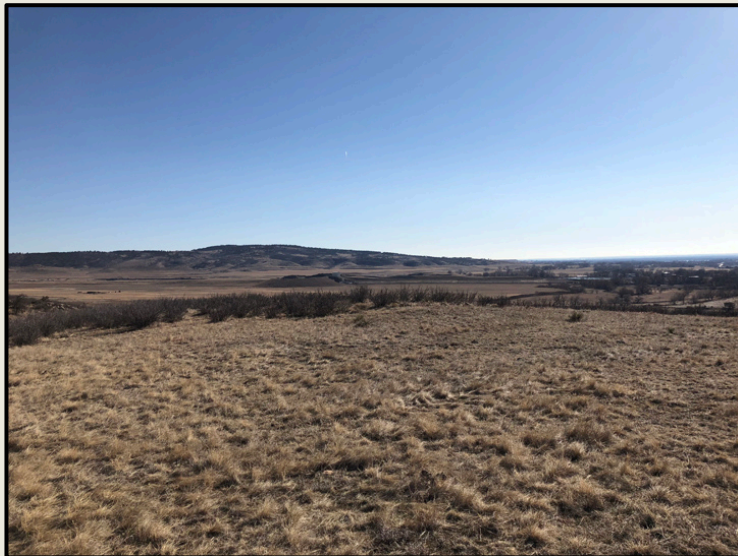
Overview of the Indian Mountain Site (Photo by Greg Wolff).

perpetuity and must remain undeveloped open space under the donation agreement to Boulder County. However, the donation agreement allows the County limited access for management purposes and valid scientific, educational, or cultural purposes.