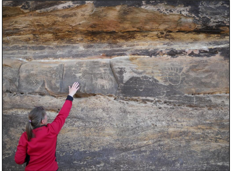
Tonya Pfennig pointing to a fully-pecked developmental quadruped, at the Hicklin Springs petroglyph site