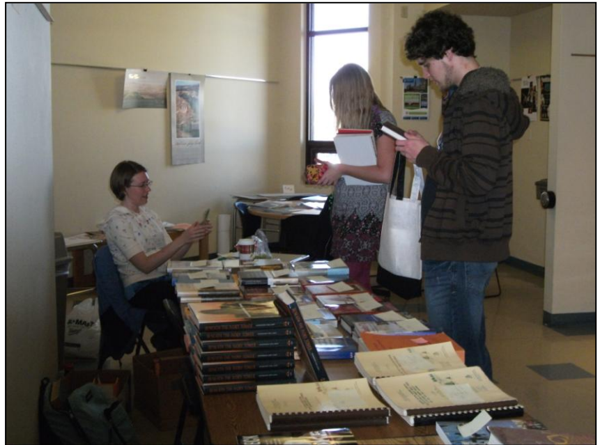
Eager CCPA meeting attendees perused the book sale's extensive selection of donated books