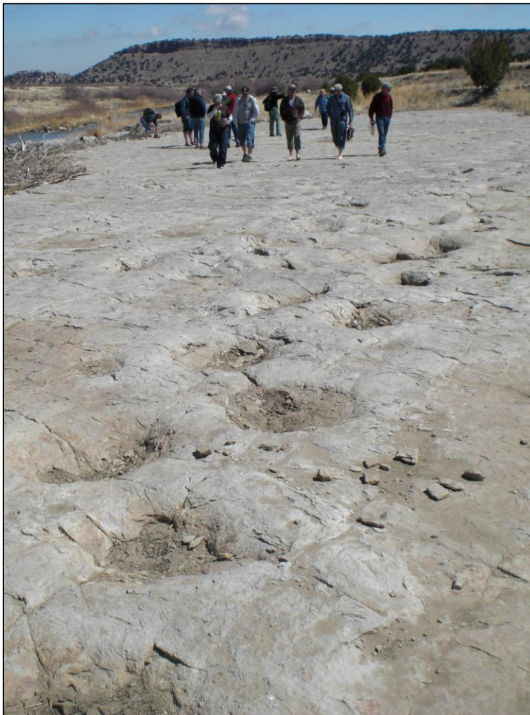
Fieldtrip attendees at the dinosaur trackway along the Purgatoire River