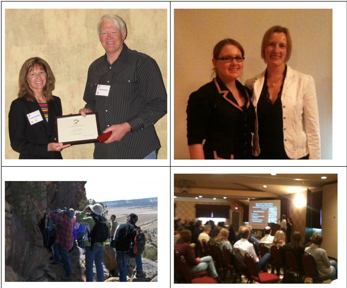
Photo Highlights from Montrose 2010 Annual Meeting