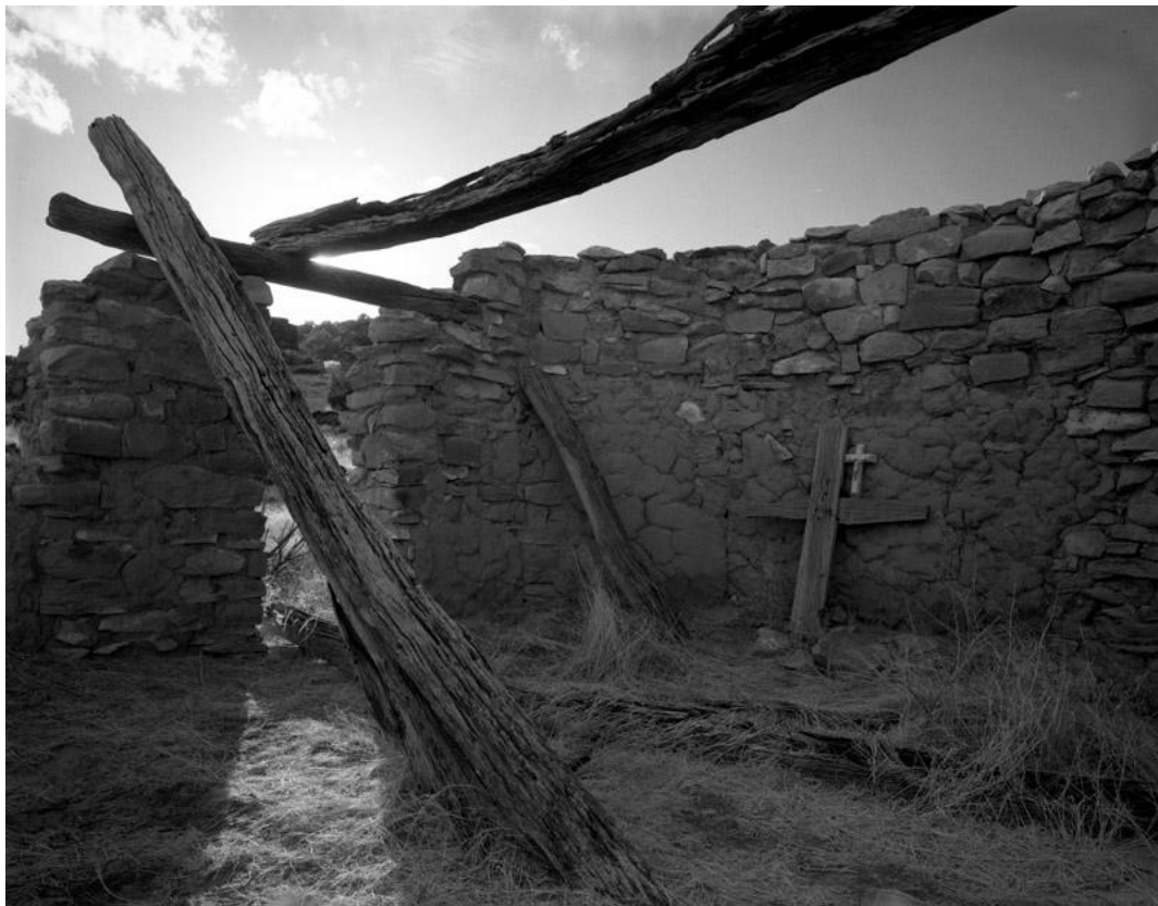
Dolores Mission, Purgatory River, Colorado